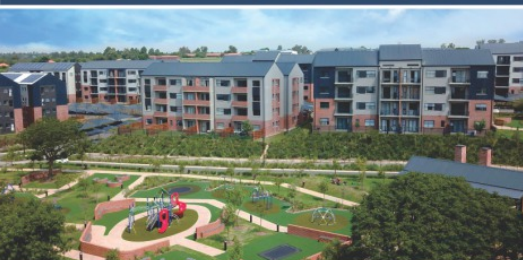
The Parks, Riversands Located next to Steyn City, Riversands, Joburg