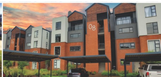
The Oval Apartments @ The Hills Located on Garsfontein Rd, Mooikloof, Pretoria