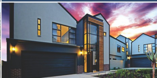
The Villas, Waterfall Located inside Waterfall Estates, Joburg