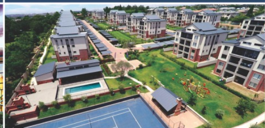
Crowthorne Luxury Apartments Located on Whisken Rd, Midrand, Joburg

For more information on any of these developments, contact us on 0800 736825