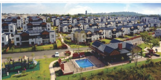
Carlswald Luxury Apartments Located on Tambotie Rd, Midrand, Joburg