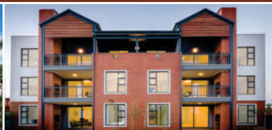
The Oval @ The Hills Game Reserve Completed 1 - 3 Bedroom Apartments (Pretoria)