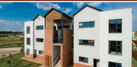
Carlsward Luxury Apartments Completed 1 - 4 Bedroom Apartments (Midrand)

Other RENTAL projects currently available through Century Property Developments